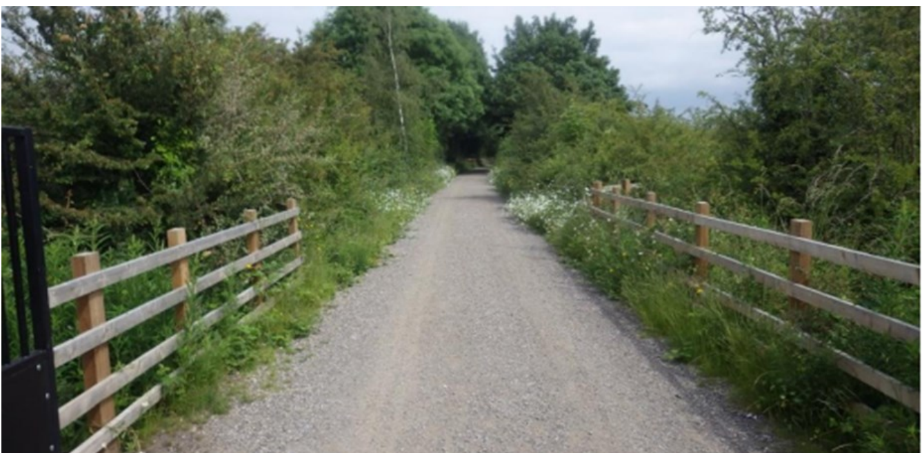
Clowne Greenway—Completed 2021

Works can only be undertaken between 7am and 6pm Monday to Friday and 8am to 1pm on Saturdays. It is anticipated that the work will take up to 12 months from December 2024 to December 2025.