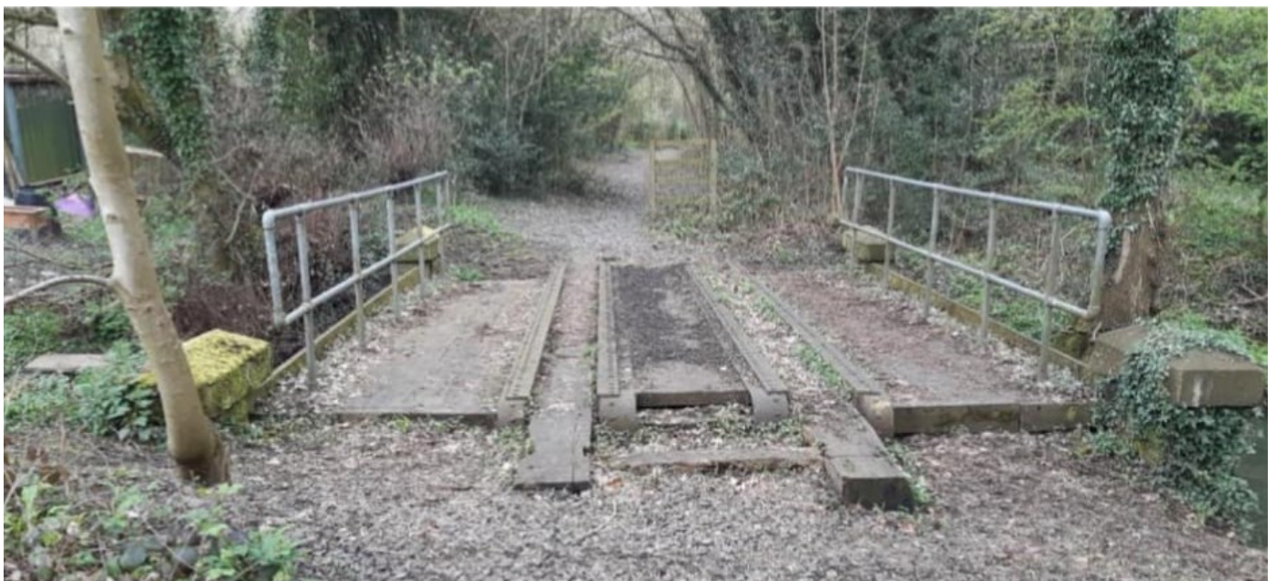
View north looking towards Jack O'Darley's Bridge, Little Eaton

The route also joins seven existing footpaths and one bridleway.